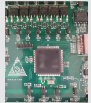
Intelligent Control System