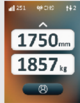
HMI Screen (Optional weight indicator)