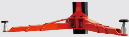
Four 3-Stage Arms