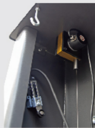
Height Limit Switch and Displacement Sensor