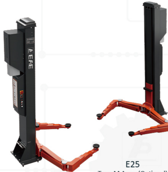
E25 Type M Arms (Optional)