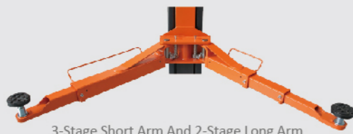
3-Stage Short Arm And 2-Stage Long Arm