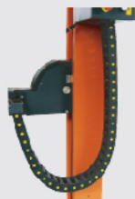
Oil Hose Protection