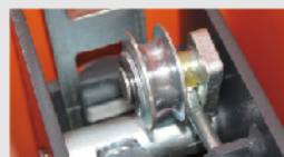
Solid and Robust Cable Pulleys