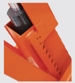
Pneumatic Release Mechanical Lock