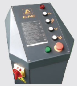
24v Safe Control System