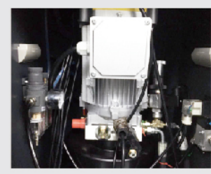
High Quality Ball Valve