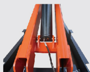
4-cylinder synchronizing structure