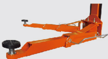
3-Stage Short Arm And 2-Stage Long Arm