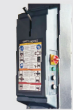
Handle for Release & Descent