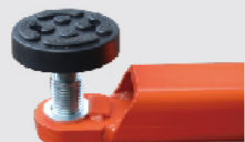
Round Screw-up Lifting Pad